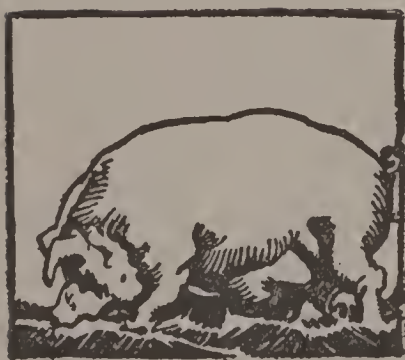
Snook John Was a Spoiled Pig.

J ACK and Evelyn had been to a party that afternoon and were quite tired and sleepy. But they wanted their story just as soon as daddy came upstairs.